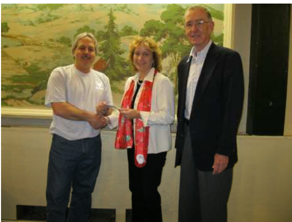
Norwich Lodge #1222 donated $500 to Winter Challenge Corporation. For the past 8 years, they have sponsored the Winter Challenge Camp held at Greek Peak Ski Area every year which through fund-raising and the enormous donation of time from volunteers provides a week long